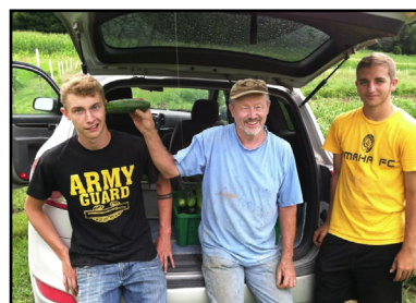
Iowana Farm Employees and Volunteers