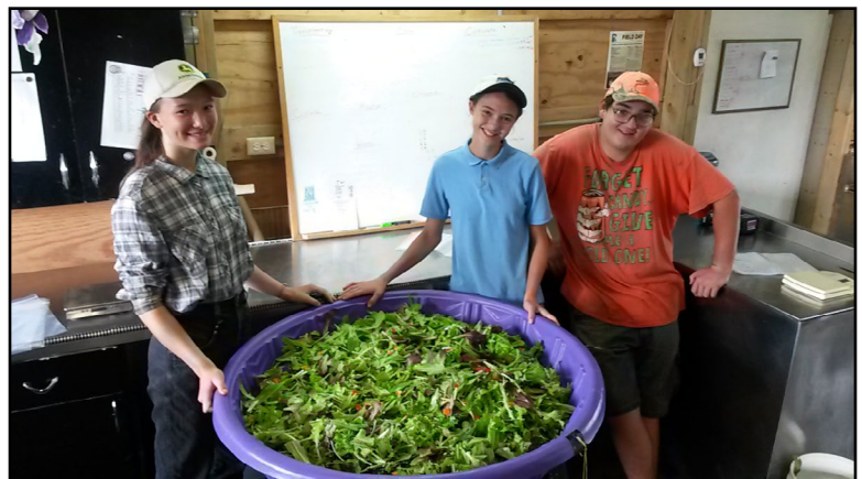
Blue Gate Farm Employees