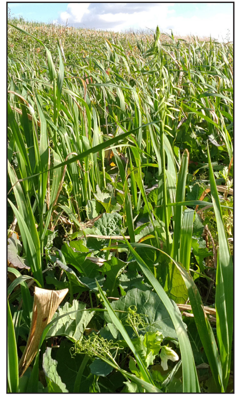
Red clover + sweet clover on Apr. 15, 2016 (left) and oats + sorghum-sudangrass + peas + rapeseed green manure mixes on Nov. 6, 2015.

established with small grain crops ahead of corn. In 2015, PFI farmer-cooperator Dick Sloan compared red clover interseeded to cereal rye and a mix of legumes and brassicas he seeded following rye harvest. The corn following red clover out-yielded the mix (209 vs. 186 bu/ac) but Dick did accomplish these yields with only 100 Ib N/ac of purchased N fertilizer applied (Gailans and Sloan, 2015). Moreover, several university researchers from the Upper Midwest have shown that using clovers established with small grain crops can substantially reduce the amount of N fertilizer necessary for a succeeding corn crop in