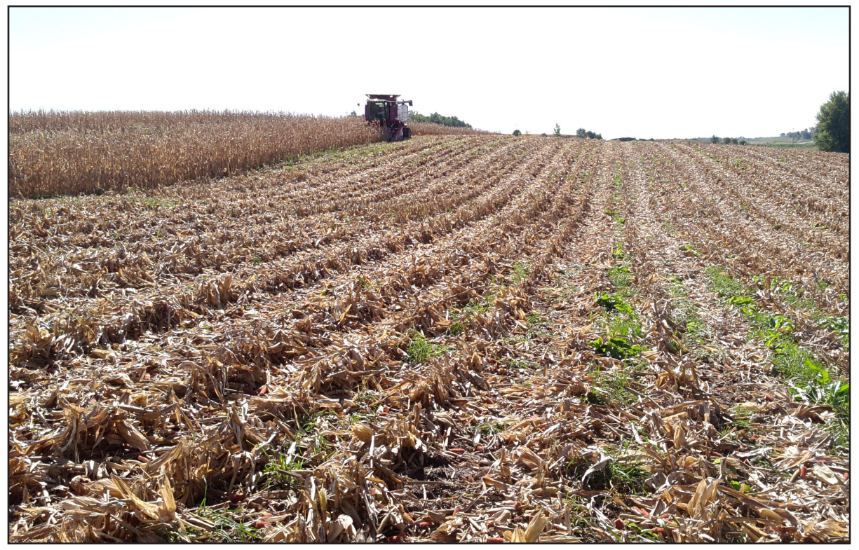
Wade Dooley harvesting corn from the experimental strips on Oct. 13, 2016.