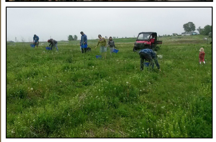
Asparagus emerging April 12 (top); spears coming through burned residue on April 18 (center); harvesting May 19 (bottom) at Beebout's.