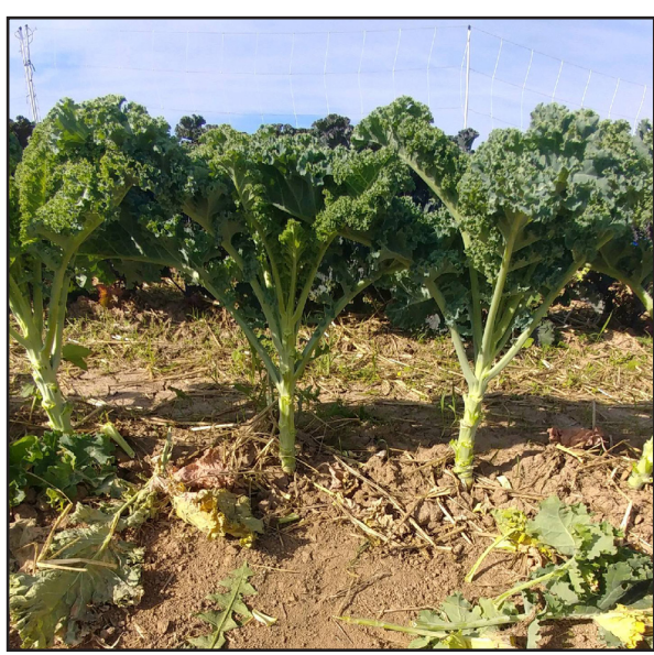
Kale plants before and after harvest. 4-8 leaves are left below the growth point, and damaged leaves are cleaned from the plant.

The thick stem, however, did seem to boost the yield - in weight - of the crop, because each leaf was heavier. The growth habit of Dwarf Siberian was also problematic. Rather than growing taller on an upright stem, the Dwarf Siberian habit was more similar to swiss chard - bushing from near the ground. Because of this, the stems rotted, making the plants hard to clean and continued harvest impossible. Black pulled the Dwaft Siberian two months earlier than the other varieties, which both lasted into November. "It needed to be cut and re-planted like chard," said Black, "it isn't suited for multiple harvests."