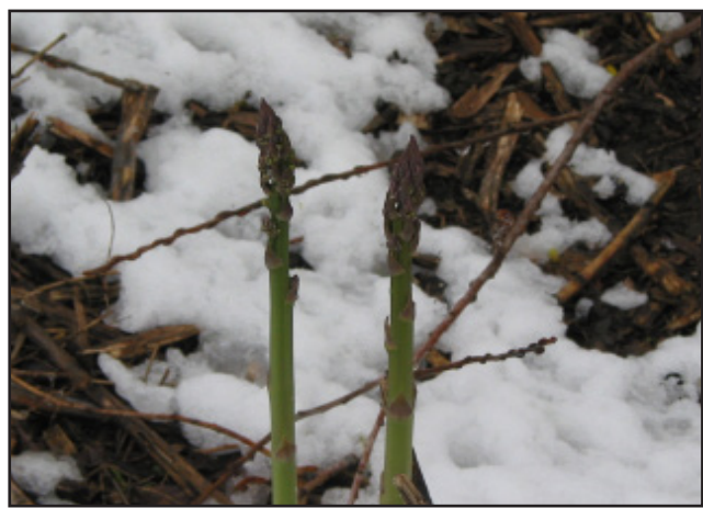
Purple Passion (top) and Jersey Supreme (bottom). Mowed-down fall residue and wood chips serve as partial ground cover at Hartmann's.