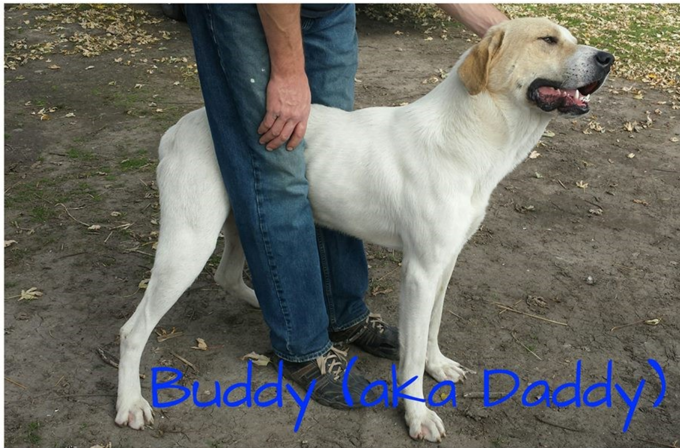
Buddy (aka Daddy)