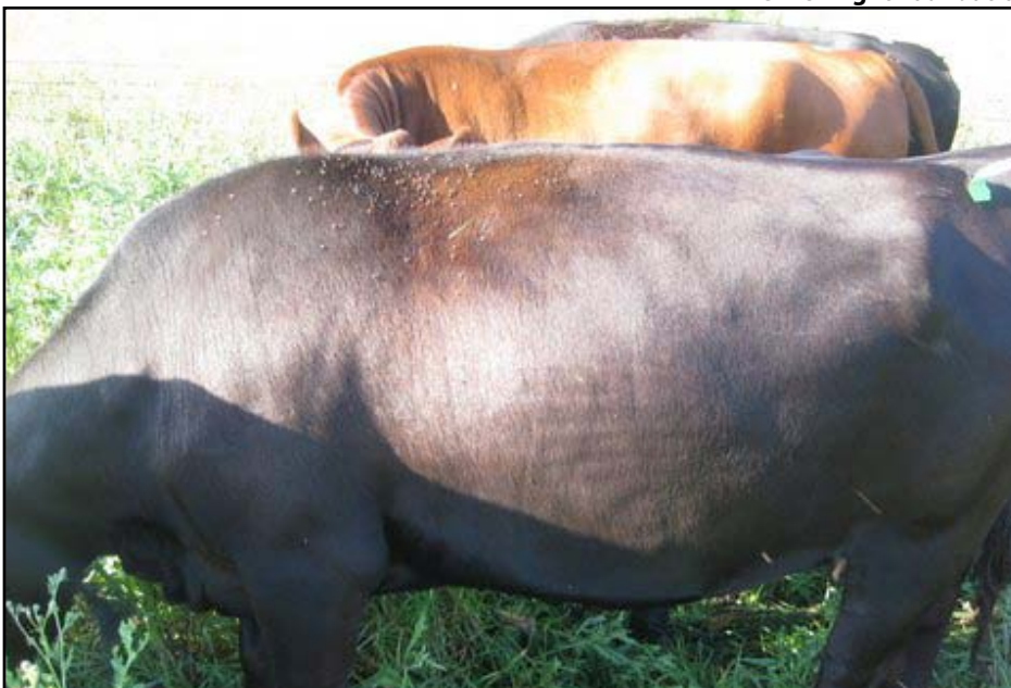
Photos of animals' shoulders and side were taken to measure horn flies, which feed on blood.