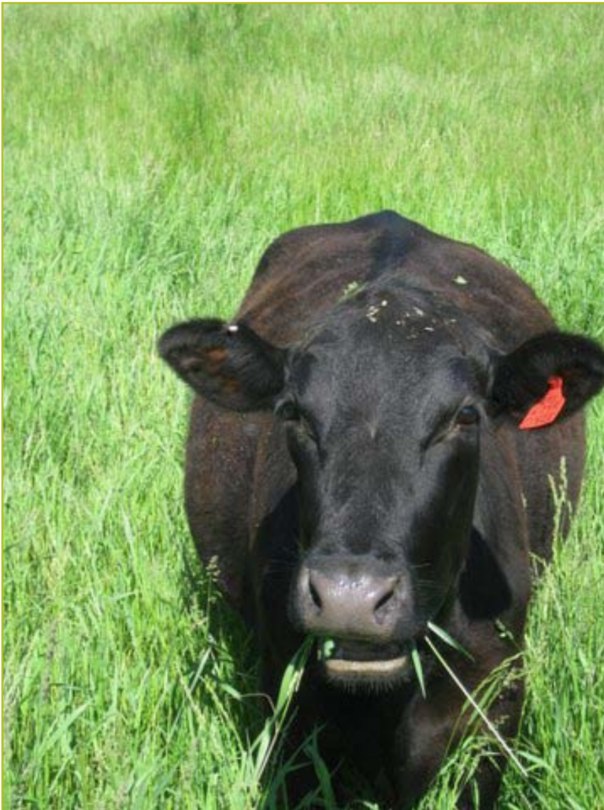
Photos of animals' faces were taken to measure face flies.

and pastures. In the past, he has added apple cider vinegar to the animals' water tanks, and would like to do so again, as it reportedly helps repel flies and improve animal health. He is also constantly trying new foliar and mineral fertilizers for his pastures – perhaps improved microbiota in the soil will allow faster breakdown of manure piles and improve animal health. Chickens may follow the sheep and cattle as well, to break open manure heaps and eat fly larvae.