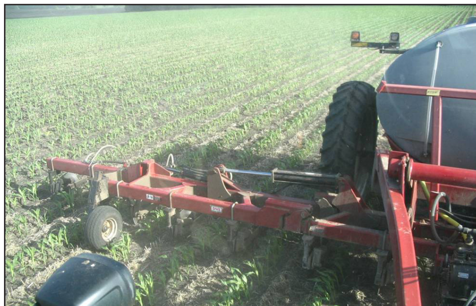
Tim Smith applying side dress nitrogen fertilizer on May 31, 2012.

Cover crops like winter rye are a rising trend with corn and soybean farmers due to their ability to reduce soil erosion (Kaspar et al., 2001) and nitrogen leaching (Kaspar et al., 2007). Nitrogen fertilizer is