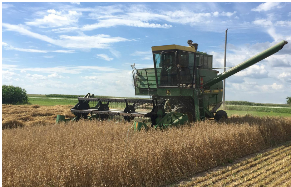
Oat harvest at the ISU Northeast Research Farm in Nashua.

Planting oats before April 15 is recommended for optimal yields in Iowa. This helps avoid exposure to warmer weather during grain fill. Test weight is the most commonly used indicator of grain quality. High test-weight varieties should be chosen by growers who intend to market oat grain to food-grade buyers. Additionally, the concentration of Beta glucans in the grain, noteworthy for its positive effects on human health, is considered by food processors. Fat concentration is also considered for storage purposes with low concentrations reducing the potential for grain rancidity and increasing shelf life.