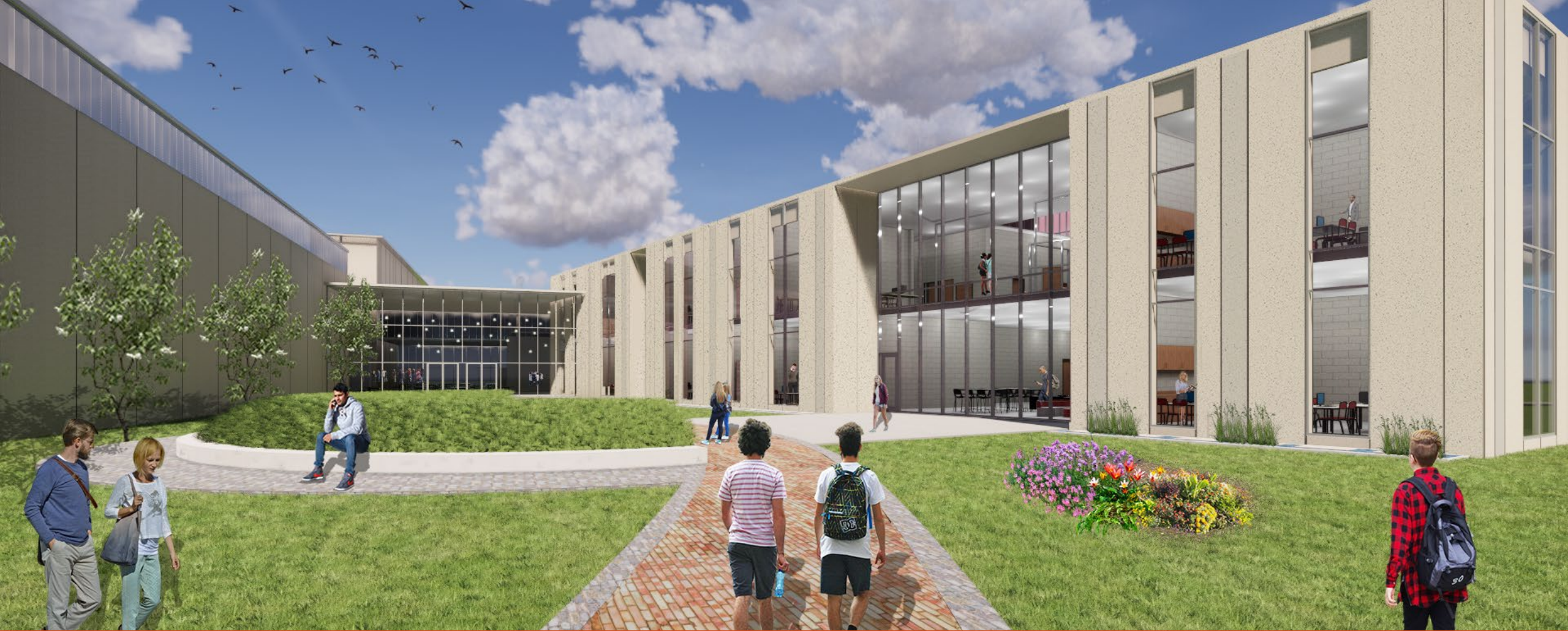
Greene County High School & Career Academy