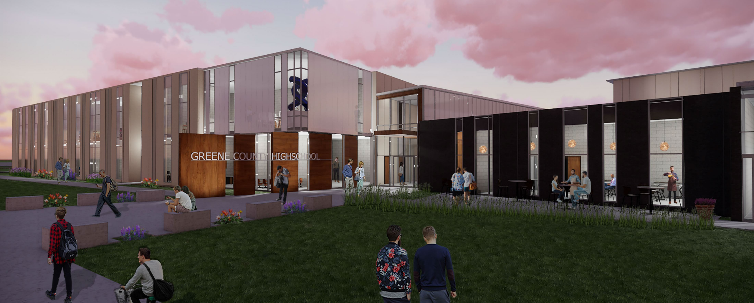
Greene County High School & Career Academy