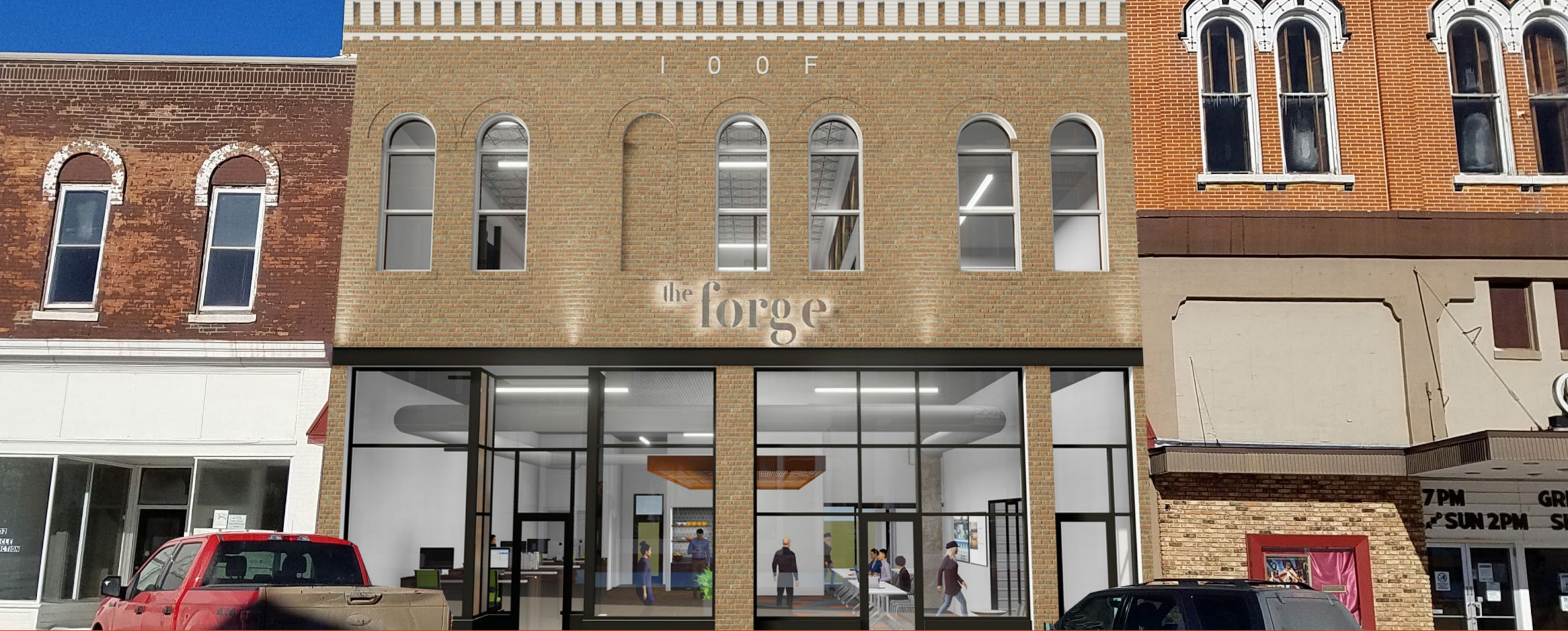
Jefferson Forge: Rehab of historic building into office