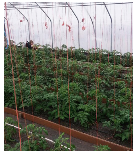
Tomatoes in the heated high tunnel at Matteson/Schick's on April 3.

Schick and Matteson want tomatoes ready early in the season, and Big Beef is an early starter. However, the combination with Bigdena has advantages, too. "Big Beef has better name recognition at the farmers market, and its harvest started sooner. But it seems to do the traditional bell curve for harvest with tomato size declining as the season goes along which decreases the amount that can be sold to restaurant customers and more