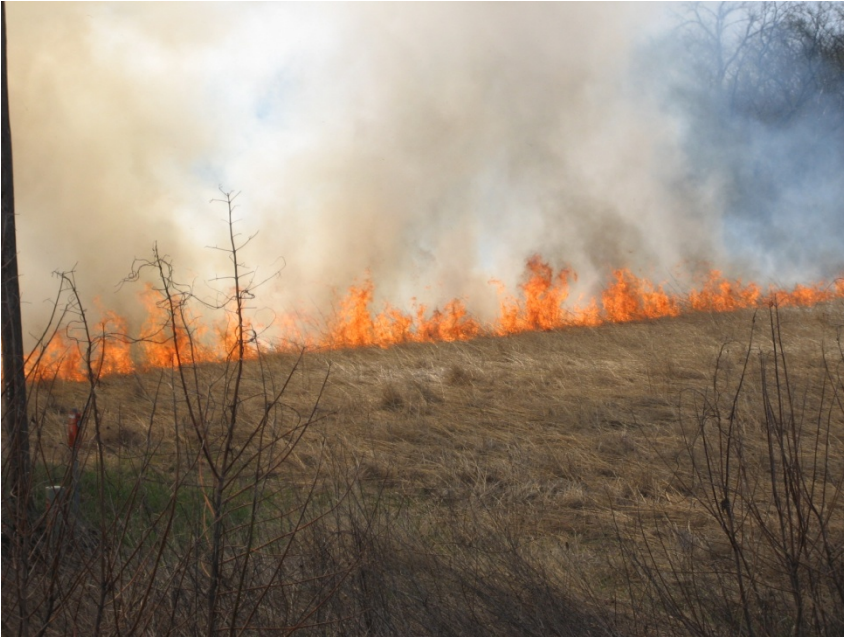
Grasses in the spring