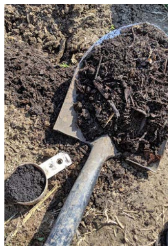
Photo 1. Compost and worm castings in the treatment Shovel + Nutrients. This photo was taken on April 26, 2020.

Double Dig - Tilled to a two-inch depth to incorporate compost. After the shallow till, "double-dug" plots to 18-24 in. depth, using "scoop and move" method. The crop was then hand-transplanted.