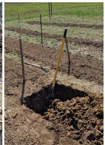
Photo 2. Double Dig plot as the top soil was starting to be removed. This photo was taken on April 26, 2020.