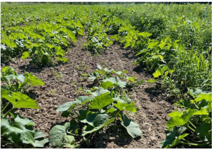
Butternut squash plants growing after hairy vetch. Photo taken June 19, 2022

By column, both values differed by more than the least significant difference (LSD), we considered the treatments statistically different at the 90% confidence level.