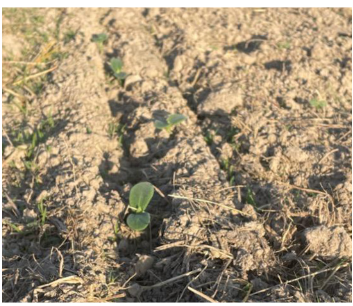
Waltham' butternut squash seedling emerging 7 days after seeding. Photo taken June 21, 2022.