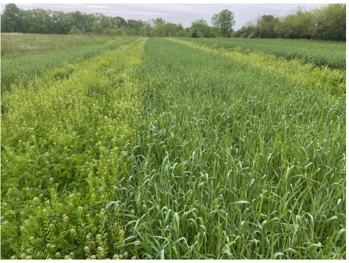
Strips of cereal rye and hairy vetch growing in spring 2022. Photo taken May 18, 2022.

Vetch plots yielded significantly more pounds of marketable squash than cereal rye plots, confirming the hypothesis ( Table 3 ). Although the number of squash was not significantly greater in the vetch plots, they produced twice as many as the cereal rye plots, 16 fruits on average in the vetch plots and 8 fruits on average in the rye plots. The number and total weight of unmarketable squash in the two treatments did not differ significantly.