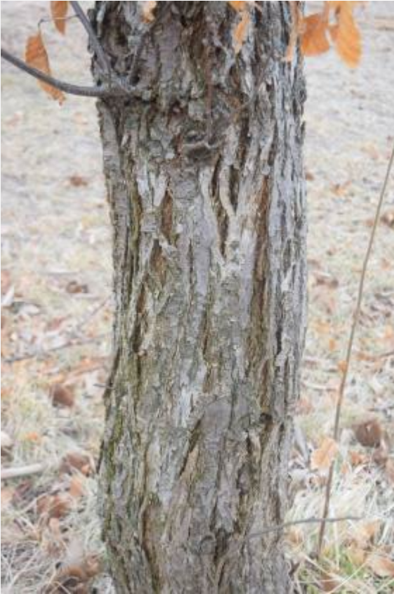
Questionable trunk health