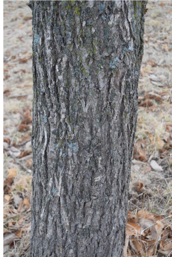
Good trunk health