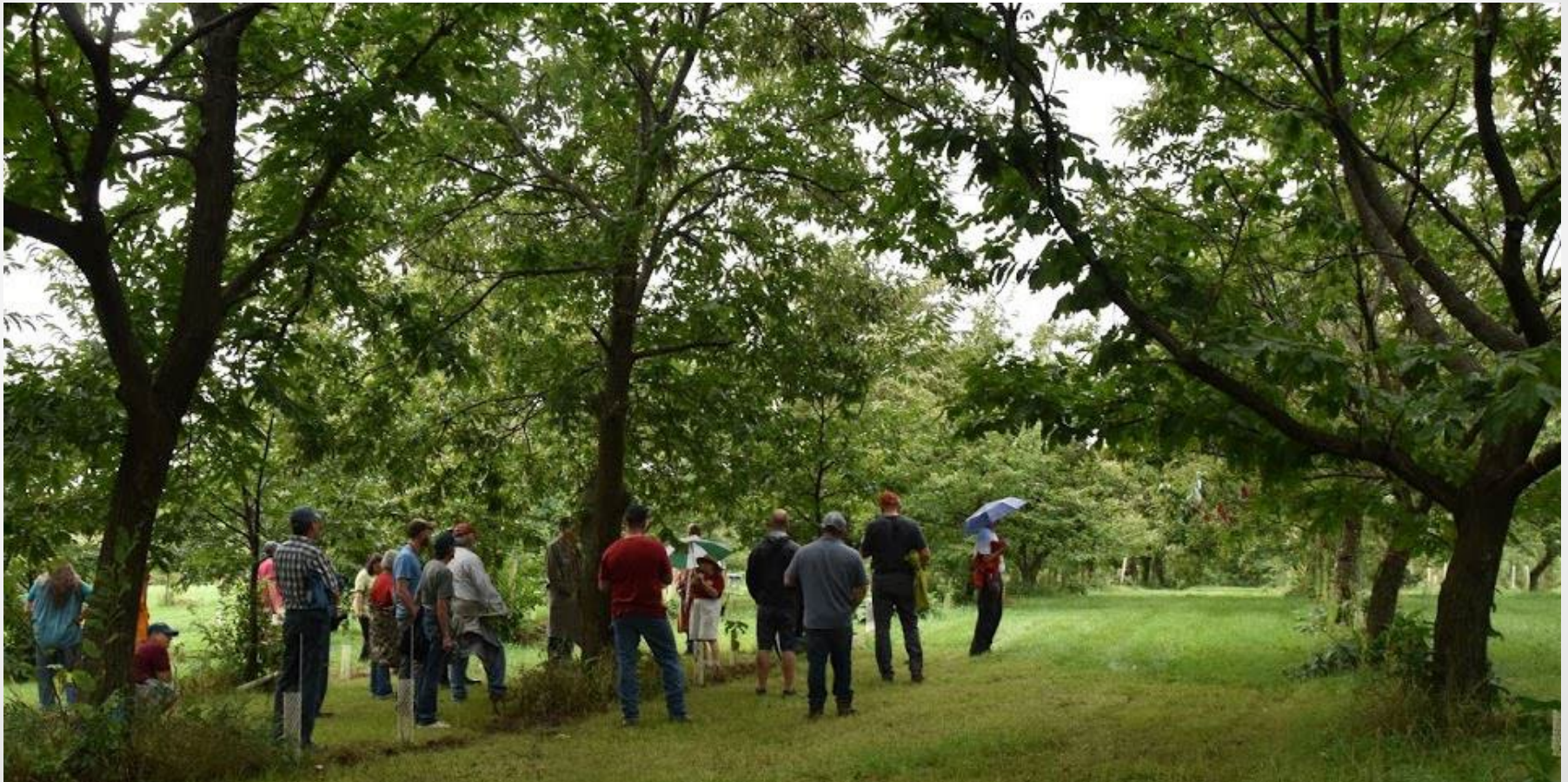
Red Fern Farm North Grove 2018