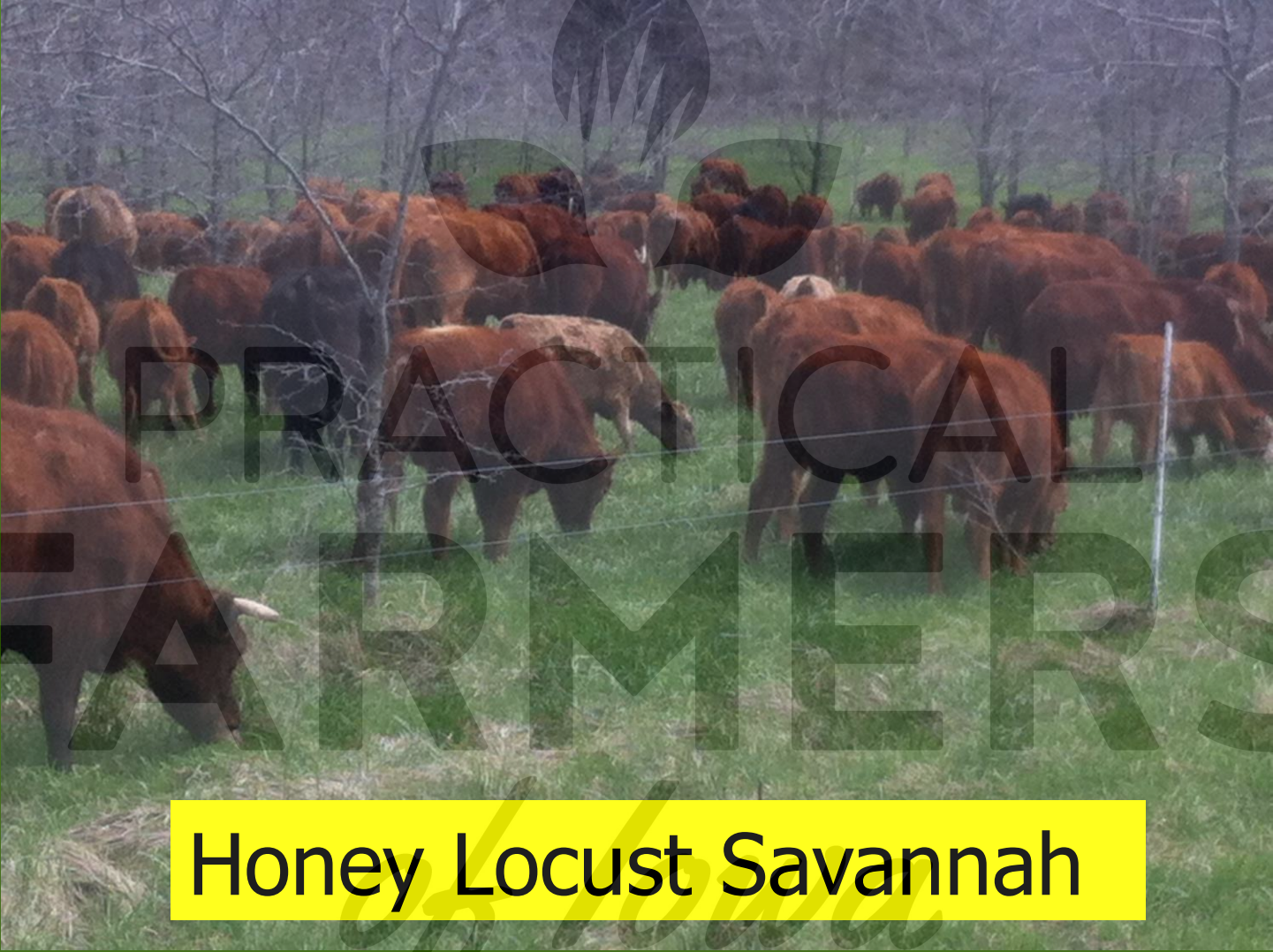
Honey Locust Savannah