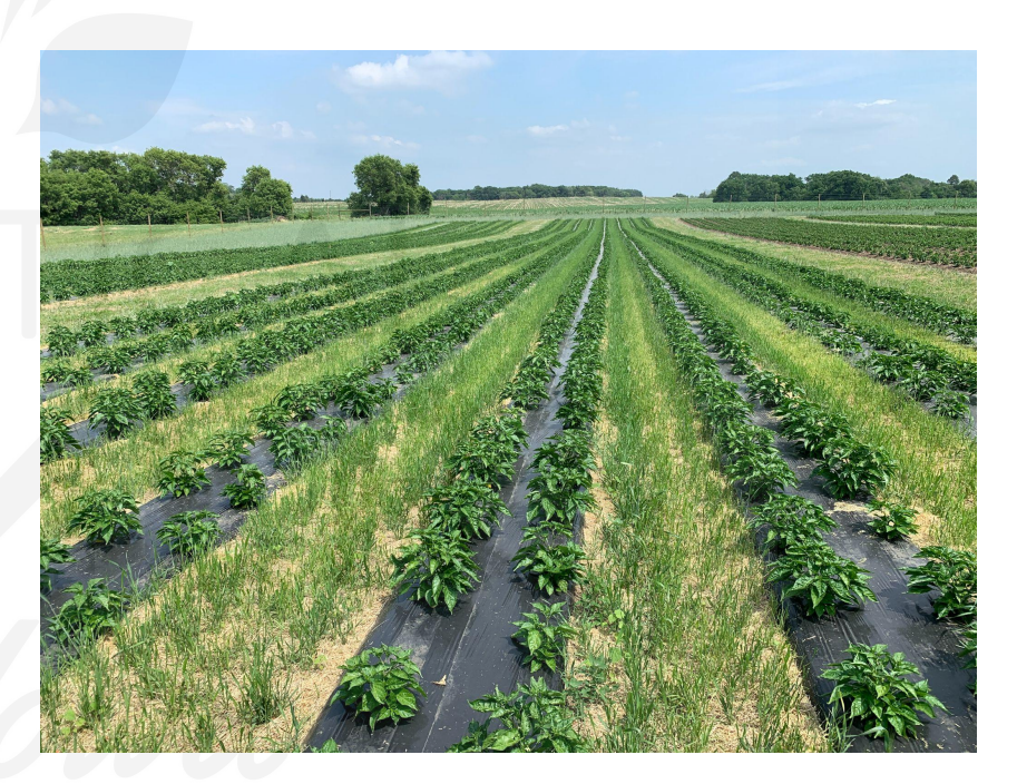
Beware of grain seed in your straw!