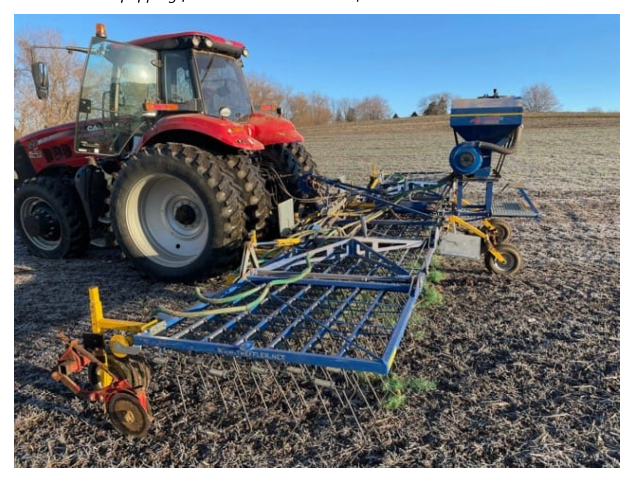
Exploring efficiency in small grains with the Wepkings

Equipping farmers to build resilient farms and communities.