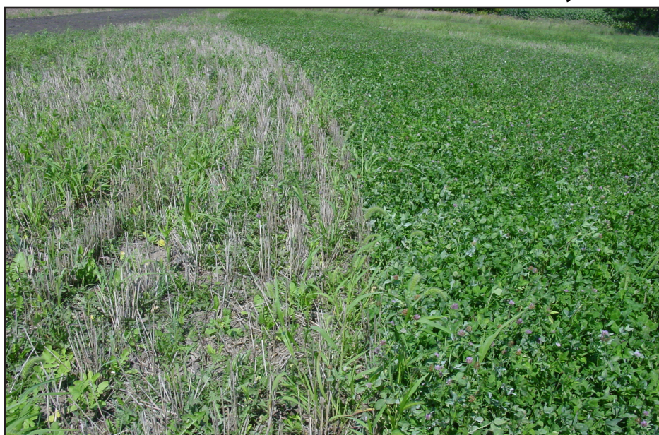
Sole crop rye stubble (left) and red clover growing in rye stubble (right)

Dick Sloan sustains 720 acres of no-till family owned cropland in the Cedar River Watershed in Northeast Iowa, producing mostly corn and soybeans.