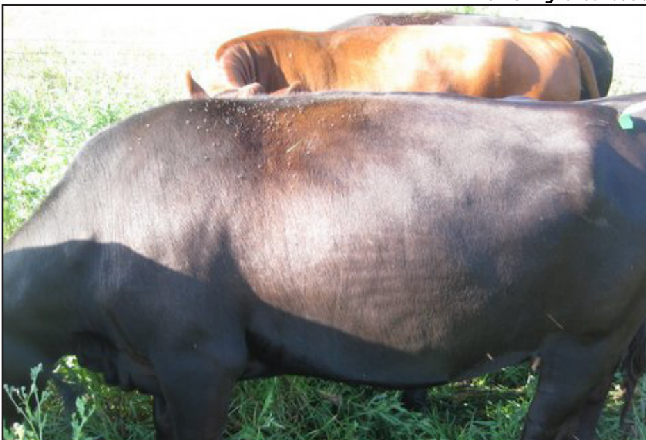
Photos of animals' shoulders and side were taken to measure horn flies, which feed on blood.