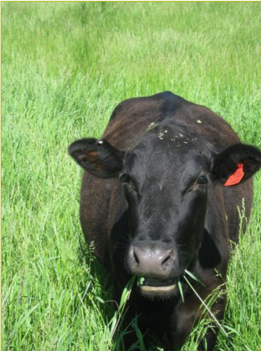
Photos of animals' faces were taken to measure face flies.

and pastures. In the past, he has added apple cider vinegar to the animals' water tanks, and would like to do so again, as it reportedly helps repel flies and improve animal health. He is also constantly trying new foliar and mineral fertilizers for his pastures – perhaps improved microbiota in the soil will allow faster breakdown of manure piles and improve animal health. Chickens may follow the sheep and cattle as well, to break open manure heaps and eat fly larvae.