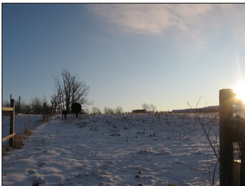
Here cattle winter graze a corn field.