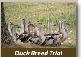
Duck Breed Trial