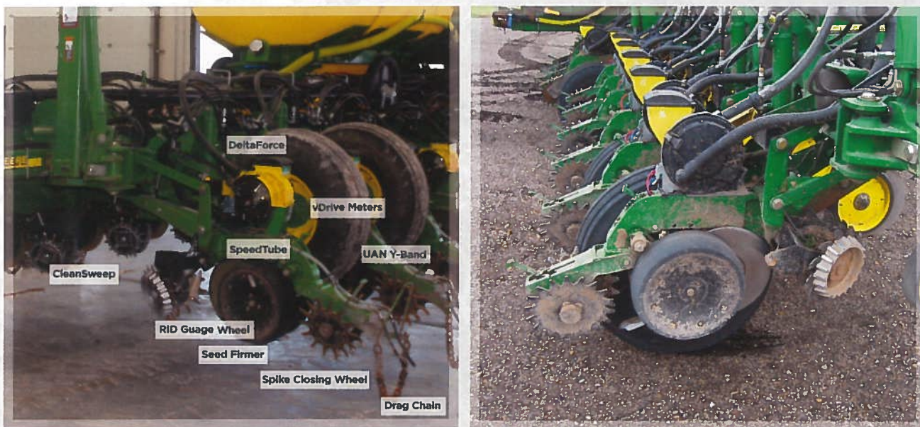
Figure 8: Planters equipped for planting into cover crops.

In Figure 8 are examples of planters properly equipped for planting into cover crops. This is conceptually only, and we do not endorse one planter brand over another.