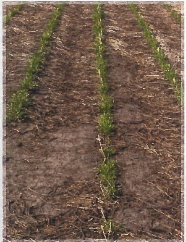
Opposite page: Figure 4. Example of strip-till cover crop system. Cover crop is established and a strip till bar creates strips in the field with no residue.