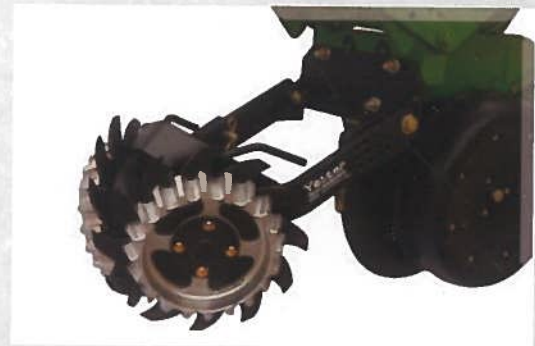
Figure 7. Examples of row cleaners appropriate for seeding into cover crops.