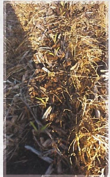
Figure 9. Example of two fields planted too early. Excess moisture created sidewall compaction or caused the trench row to open.

Depending on weather, fields planted to cover crops can be drier or wetter compared to no cover crops. Excessive rain after early cover crop termination can create conditions where the field stays wetter compared to no cover crops. Conversely, due to cover crop water use, fields planted to cover crops can be fit sooner than fields without cover crops. The key is to recognize that cover crops affect the time of fitness for planting compared to no cover crops. Check your fields. A little extra patience in waiting a few days for a cover crop field to dry out can dramatically improve stands and yield when planting into cover crops (Figure 9).