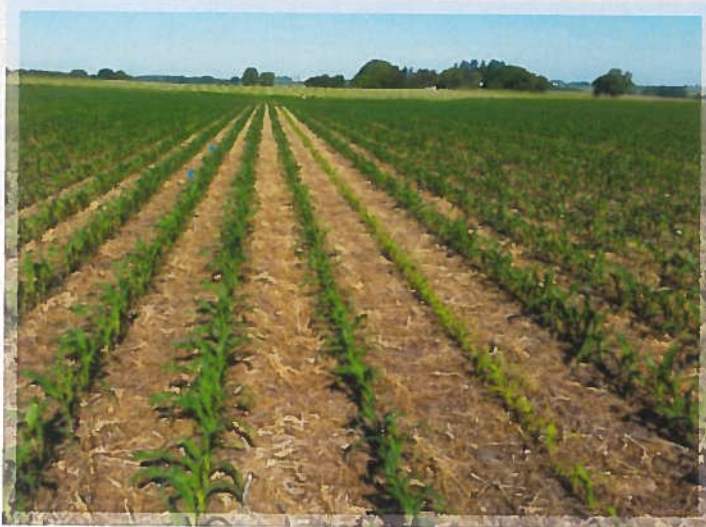
Figure 1: Excellent stands achieved in cover crop system. Note stunted row in corn field due to starter fertilizer plugging (left). Also note dense mat of residue preventing weed emergence in soybeans (right).