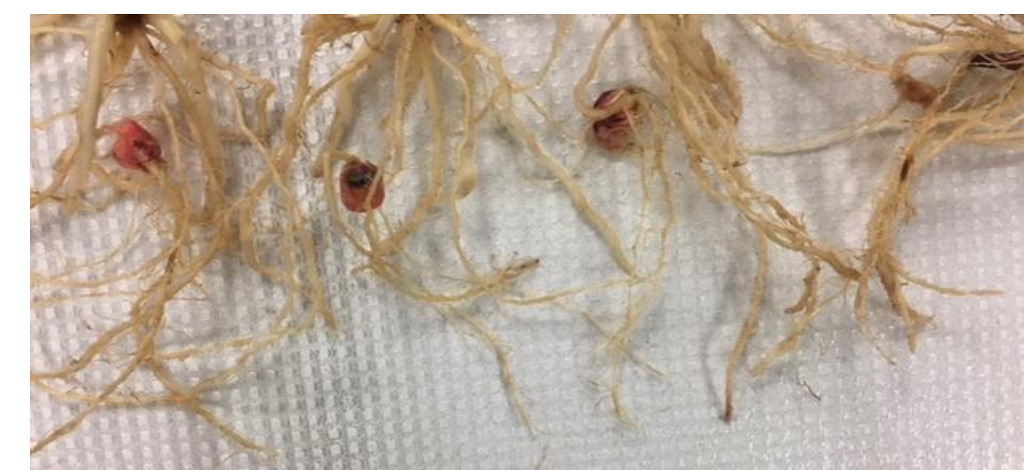
Figure 3. Healthy roots observed on corn seedlings sampled from strips planted 14 days after cereal rye was terminated.