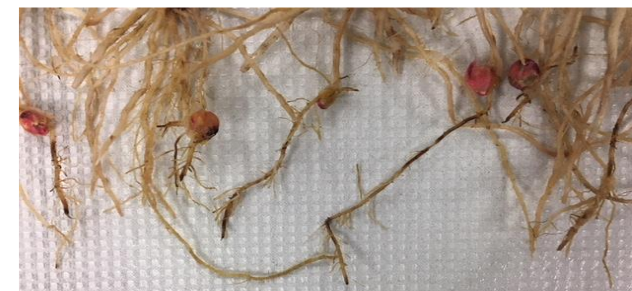
Figure 2. Typical root rot symptoms observed on corn seedlings sampled from strips planted 2 days after cereal rye was terminated.