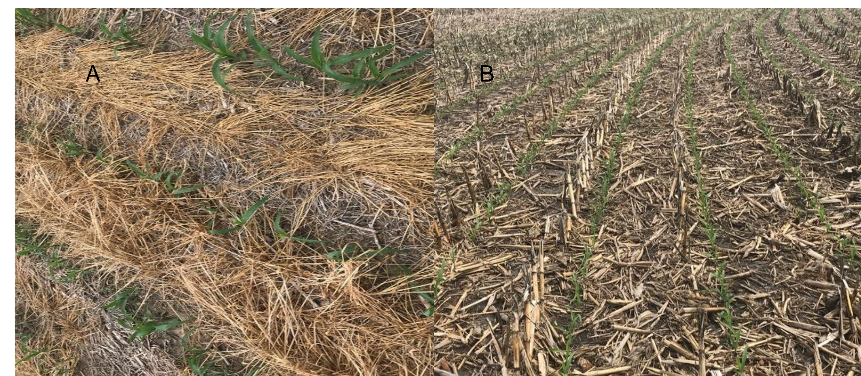
Figure 1. Research strip plots. Corn planted 0-2 days after rye termination in a no-till corn-soybean field in Iowa (A). Corn planted approximately 2 weeks after terminating rye in a no-till corn-corn field in Iowa. The rye was aerially seeded (B).